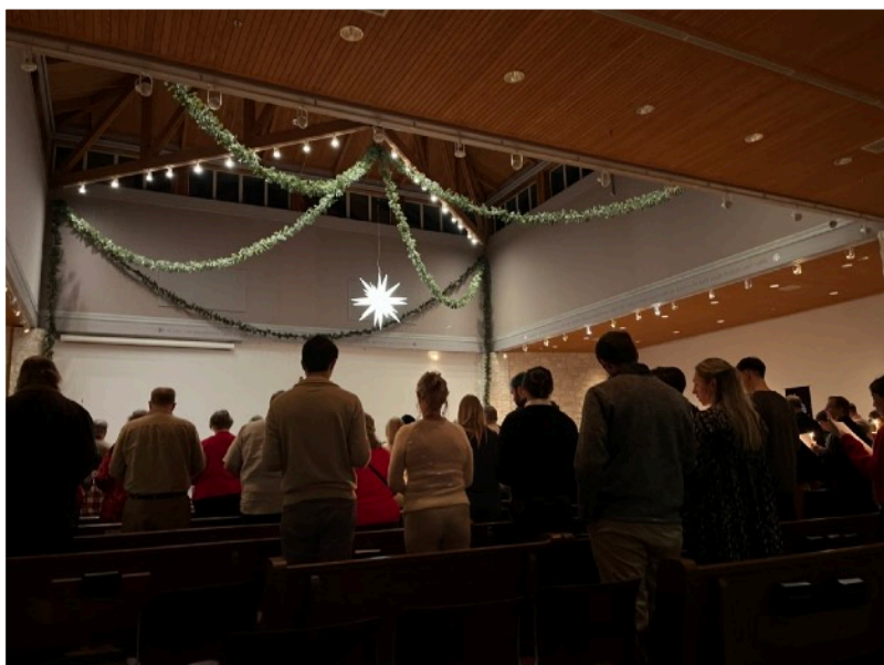
The singing of "Silent Night" on Christmas Eve transforms our sanctuary into an especially holy and beautiful space.