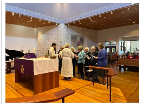
On Sunday, December 10, during the 11am service, the Daughters of the King welcomed three new members into their order.